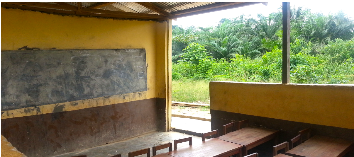
Figure 2: School classroom in a community

income. 74 Corporal punishment in schools is also a significant problem where 36.9% of urban children and 30.4% of rural children reported being beaten by a teacher or head teacher at school in the past month. 75 Forms of punishment at school may also be cruel and include exploitative practices such as fetching water, filling 'polytanks', and other such chores around the school. 76 This is disproportionately experienced by children engaged in labour in cocoa, whose frequent lateness, caused by challenges in managing farming, domestic chores and school, results in punishment. 77 Farmers in communities complained that their children were often late for school because it was their responsibility to fetch water from the well in the mornings, which provided inadequate water for the whole community. The research team also observed many children in communities undertaking work in and around schools, such as cutting long grass and trees with cutlasses, and were informed that given it was the first days of school, children were often called to help 'clear up' school grounds to prepare for the new school year.