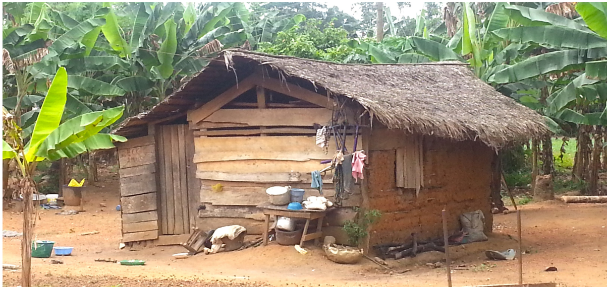
Figure 1: A house in a community

raise the family's honour and socio-economic status through their future success. 59 While living in their family households, children are strongly influenced to be obedient and help 'earn their keep', even if their future is not considered to be in cocoa, or even in the village.