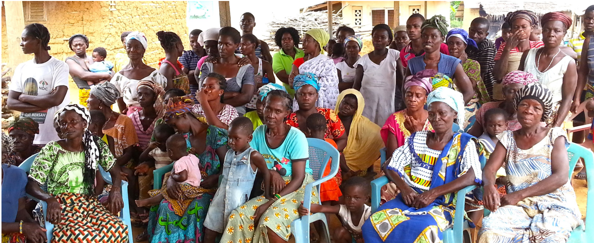
Figure 3: Women in a community just before a focus group

There is also a lack of clarity in Ghanaian law regarding the property rights of spouses during and at dissolution of marriage.